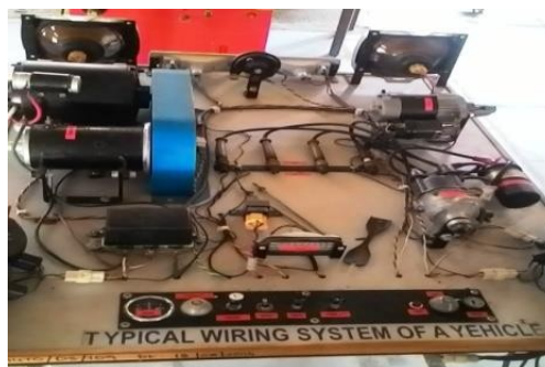
Typical Wiring system of a vehicle