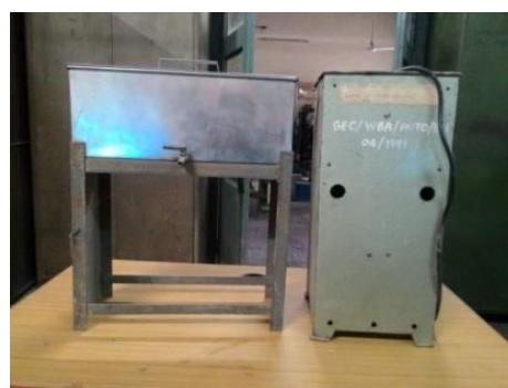
Distillation Test Apparatus