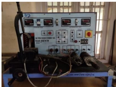
Auto Electrical Test bench

This laboratory houses a demonstration and experimental facilities for various automobile electric systems like battery, ignition system, charging system, starting system etc. Major Equipments are Battery Charger, Typical wiring system of vehicle, Auto Electrical Test Bench of Starter & Alternator.