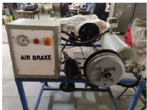
Working model of Air brake

This laboratory houses a demonstration and experimental facility for Various transmission system like clutch, brake , Gearbox, Suspension system etc. Major Equipments in lab are cut section of brake & suspension, Cut section of differential axle tube type, Cut section of torque converter (fluid), Actual Working Model of Air Brake, Cut Section of Original Power Steering System.