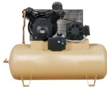
Two stage Air compressor