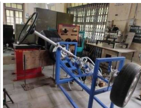
Cut Section of Power Steering System