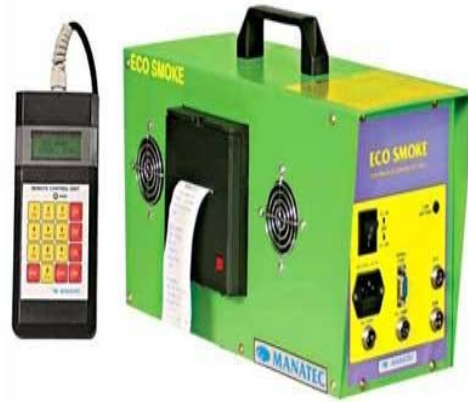
Diesel Smoke meter